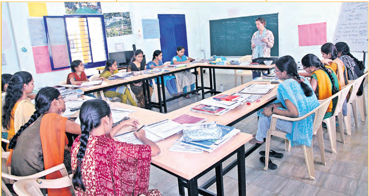
Learning to develop proficiency for better career