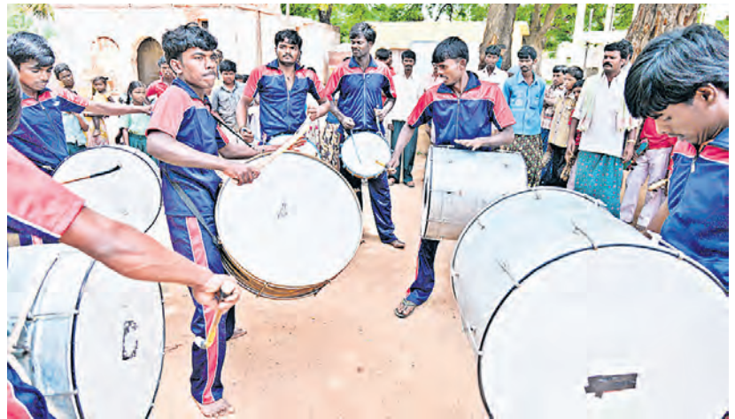
Skills - An effort to improve livelihoods of youth

To achieve social empowerment of target communities by developing and demonstrating quality cultural skills and professionalism in children and youth and achieve change in the society.