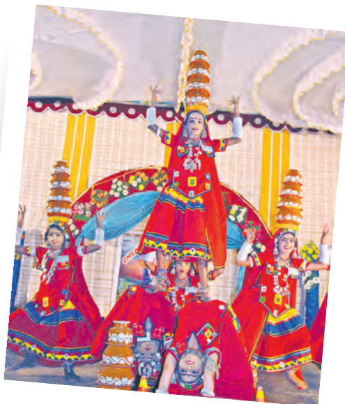
Performing on stage helps children to develop self confidence

To promote primary level cultural education, 98 special cultural schools are selected and integrated cultural skills are imparted to the children throughout the academic year in B.K.Samudram, Bathalapalli, Kadiri, Madakasira, Adoni and Srisailam regions.