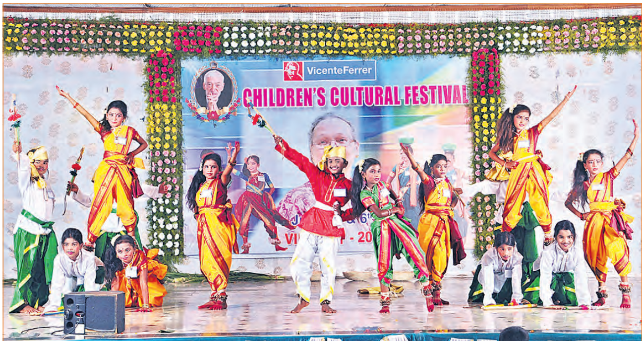
"Vikasam" is a platform to showcase the Children's Cultural Skills

RYDT's mega cultural festival VIKASAM was organized in May and June 2017 for the children from the villages as well as the residential schools of the Children with Disabilities. The winners at regional level participated in Solo Song, Group Song, Duet Song, Dappu, Solo Dance and Group Dance held at central level at Ananthapuram. This event brought out the excellent talents of the children into limelight. The best performers emerged as the champions of the event.