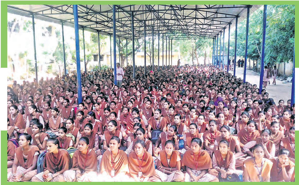
Awareness is a key element to enable the girls to utilize Child Line Services

During the reference year, 65 awareness campaigns have been conducted covering 6685 boys, 9224 girls, 1721 adults and 400 Government officials. The primary focus of these campaigns is to educate the public on prevention of various child related issues and problems and promote toll free number 1098.